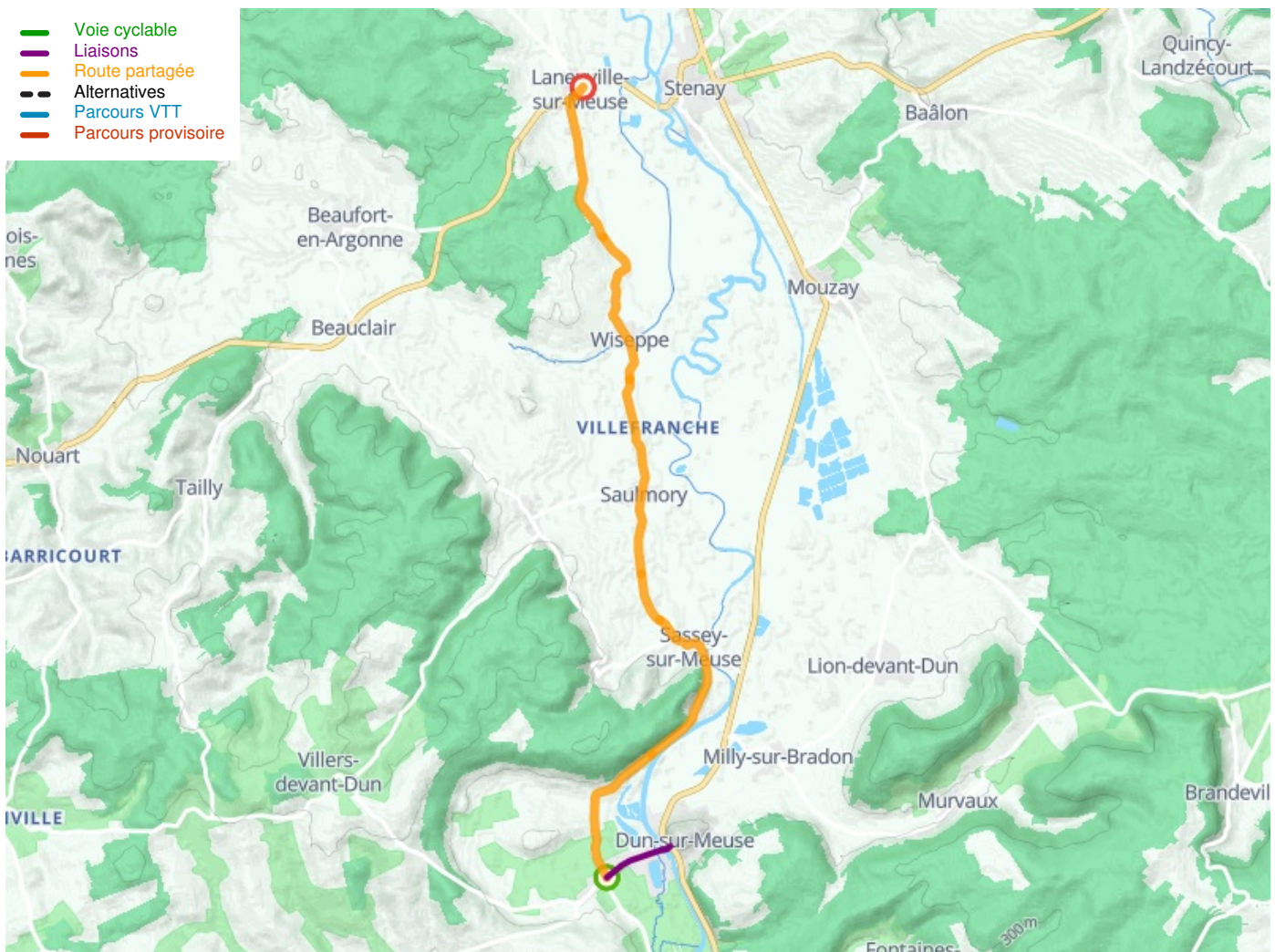
Départ Dun sur Meuse